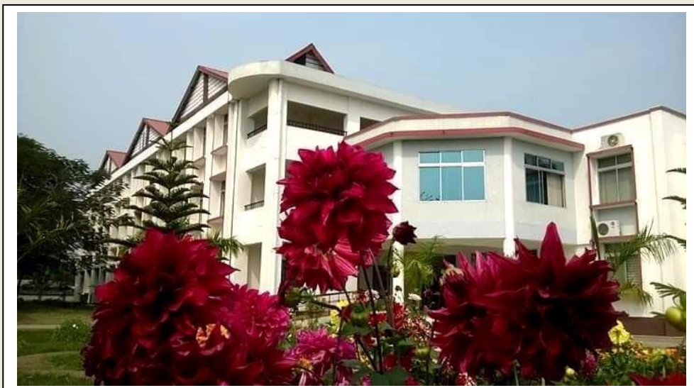
SCHOOL OF ENGINEERING, TEZPUR UNIVERSITY