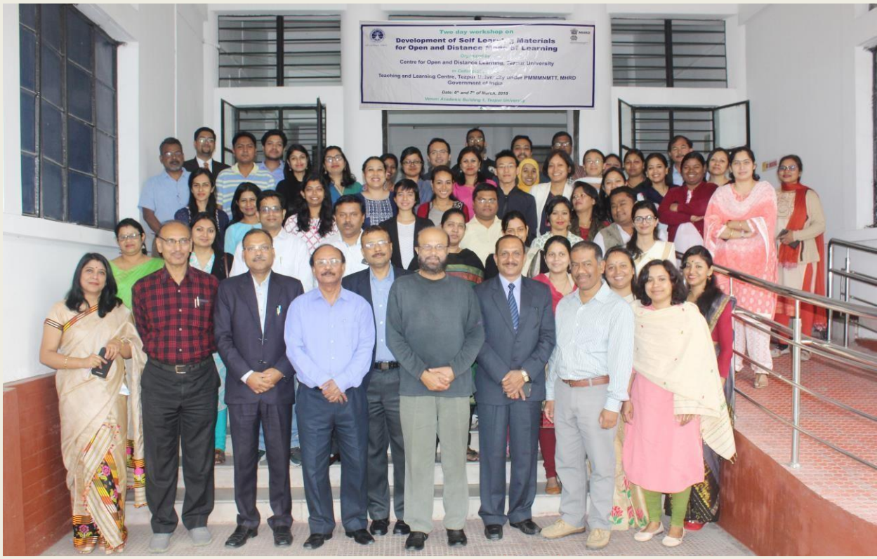
Dignitaries, Resource Persons, Guests and Participants of the two day workshop on Development of Self Learning Materials organized by CDOE in collaboration with Teaching Learning Centre, Tezpur University on 6 th and 7 th of March, 2019.