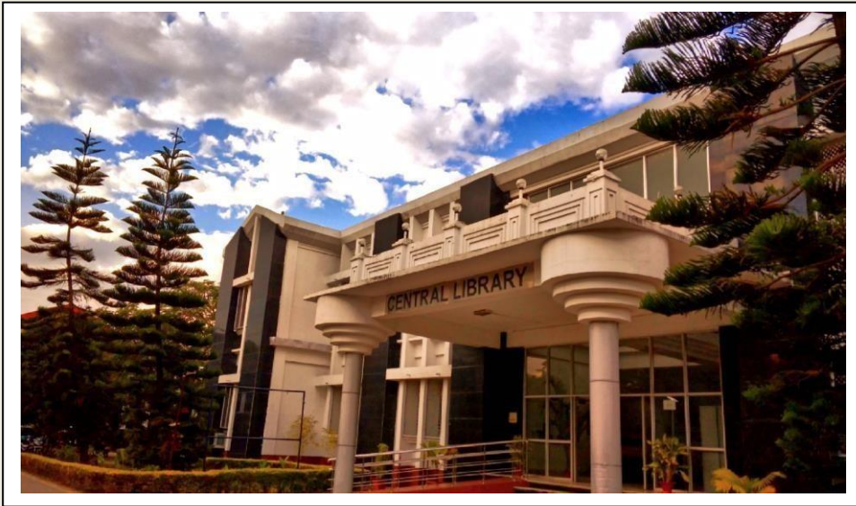
CENTRAL LIBRARY, TEZPUR UNIVERSITY