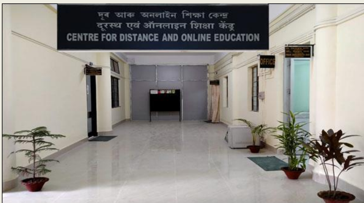
Inside view of CDOE premises