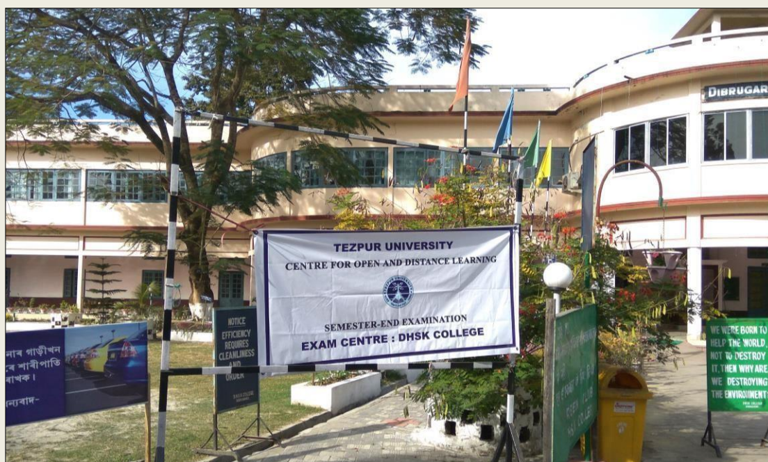
Study Centre of CDOE at DHSK College, Dibrugarh