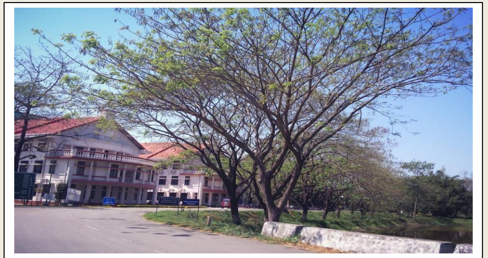
SCHOOL OF HUMANITIES AND SOCIAL SCIENCES, TEZPUR UNIVERSITY